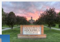
Gustavus Adolphus College