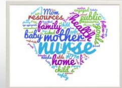
Word Cloud based on student observations