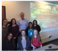
Students and preceptor at Dakota County Department of Public Health on student project presentation day.